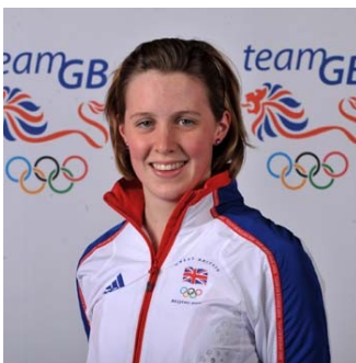
Watch out for Hannah Miley in Rome.