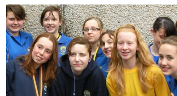
Some of the squad at the Ythan meet