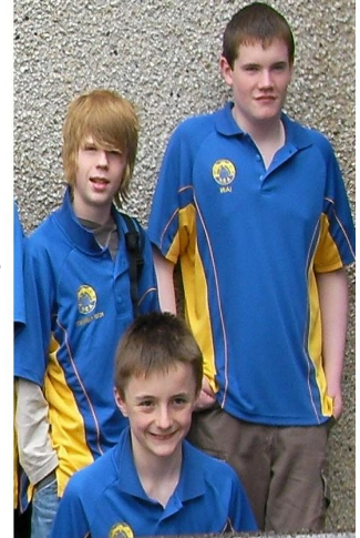
Some of the older boys at Ythan