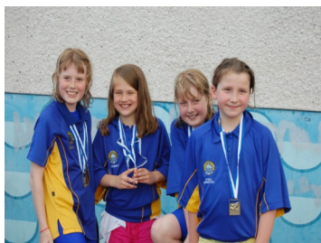
JC1&JC2 girls enjoy the Elgin mini meet

“Everyone has improved, I am so proud of you all”