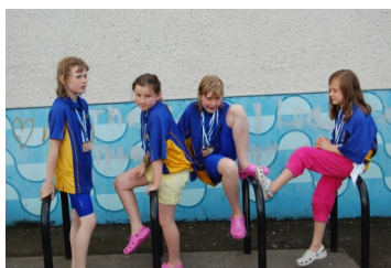
JC1&JC2 girls enjoy the Elgin mini meet

I would like to take this opportunity to thank all the coaches for their hard work and all the encouragement they have given the young swimmers in the club.