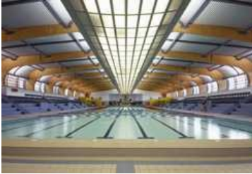
The new Sunderland Aquatic Centre