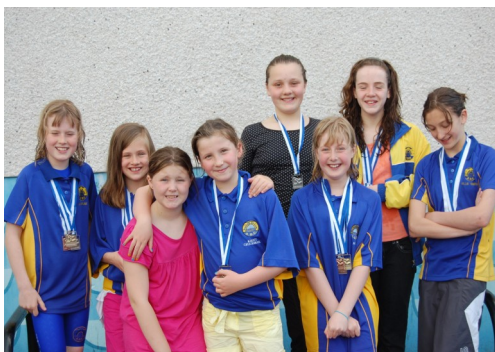
Some of the squad after the Elgin mini meet.